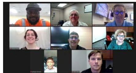
March New Employee Orientation via Zoom