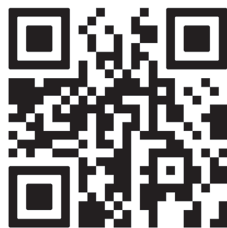
Mulch Pickup Sites

For more information, visit Pinellas.gov/mulch or scan this QR code for an online map of the mulch pickup sites.